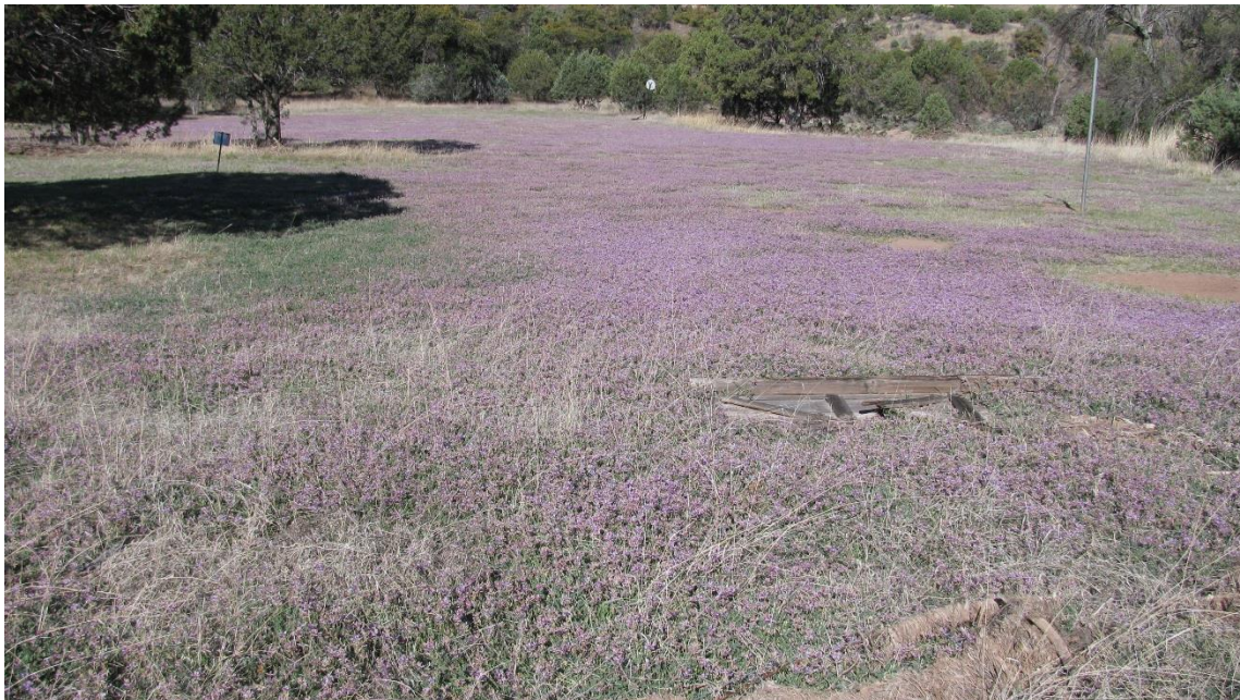
Locoweed in the Lyle Canyon area of Santa Cruz County, Arizona, April 2015.