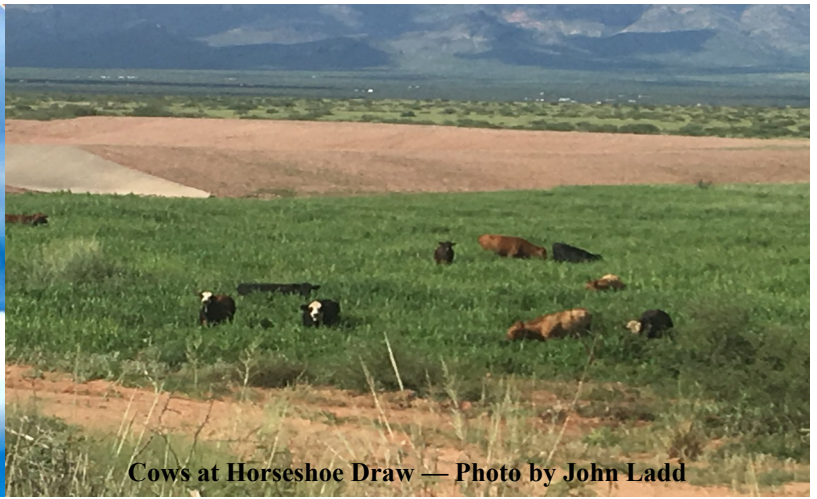
Cows at Horseshoe Draw