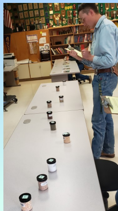
Photo 3. Skill-A-Thon Grain ID