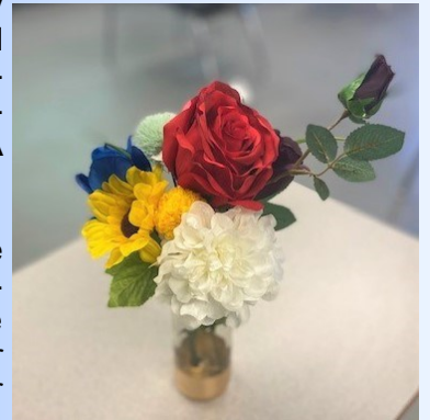
Practicing Arrangements for Floriculture Competition

Our AgriScience II students focus on learning basic biological principles through the lens of agriculture. In this course, students are able to earn their Biology credit in addition to their Career & Technical Education (CTE) credit. This semester, they have gotten to compare bacterial, plant, and animal cells using microscopes, isolate their own DNA, and are revamping the current FFA garden to better suit their vision. Later in the semester they will be performing dissections on ethically sourced fetal pigs to learn about internal anatomy. This course also had every student competing in an FFA competition. At state we received 10th place in Forestry, 10th place in Meat Evaluation, and 7th place in Range Management.